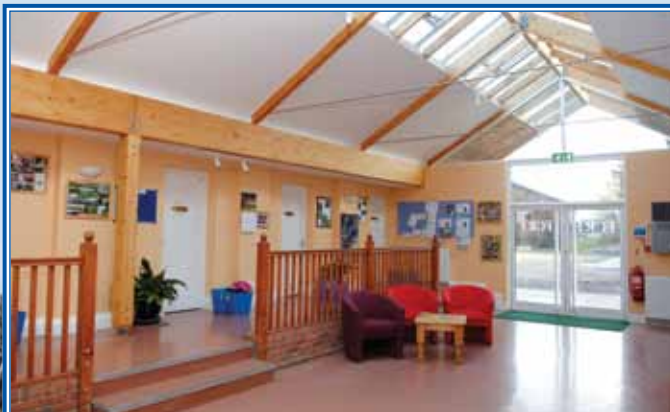
The FCRT site at Wootton Hall Farm